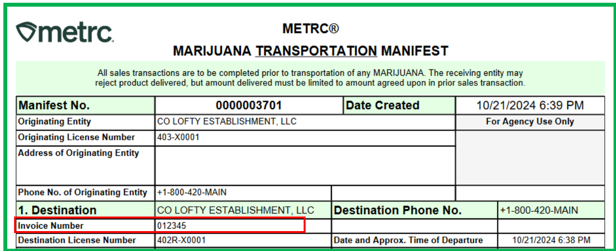
Figure 4: Invoice Number on Transfer Manifest

An example of the new Invoice Number field on the transfer manifest is shown below - see Figure 4 .